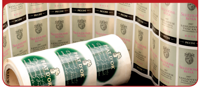
Advanced Inspection System for LABELS & NARROW WEB

No computer knowledge is required to operate thanks to an intutive interface and touch screen operations.